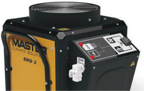
EKO 3 control panel